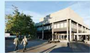
University of St. Gallen (Switzerland)