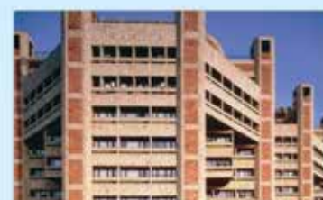
SCOPE Complex, New Delhi