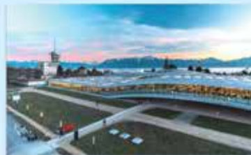
Ecole Polytechnique Federale de Lausanne (EPFL) (Geneva)