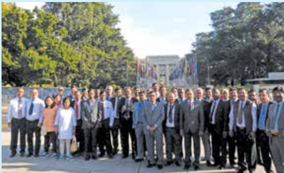
Participants at United Nations Office, Geneva.