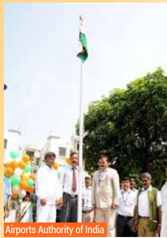
Airports Authority of India