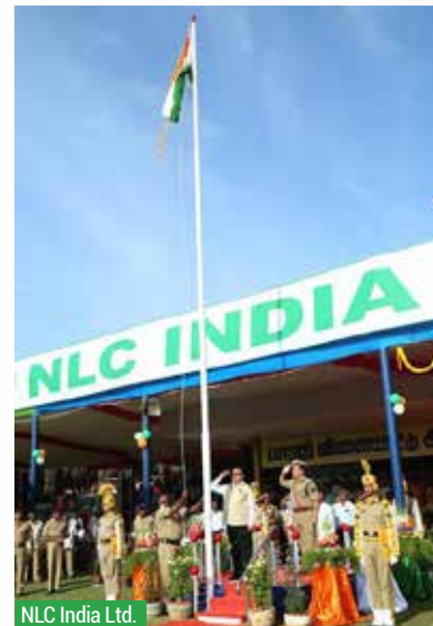
NLC India Ltd.