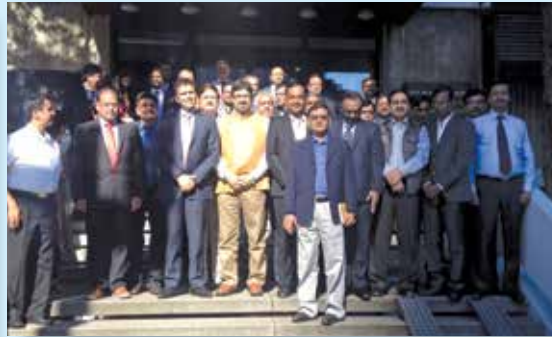
Participants at The Indian Consulate, Stuttgart.