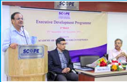
Vice Chairman, SCOPE inaugurates the 2nd batch of APSE