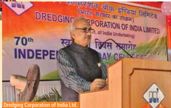
Dredging Corporation of India Ltd.