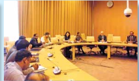
Participants at International Labour Organization, Geneva.