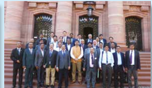
Participants at the Hessian Trade & Invest GmbH, Germany.