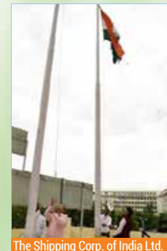
The Shipping Corp. of India Ltd.