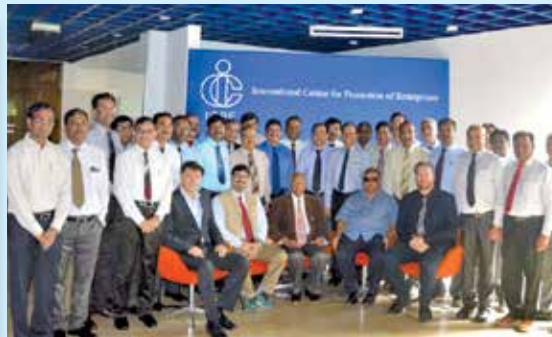
Participants at International Centre for Promotion of Enterprises, Ljubljana (Slovenia).