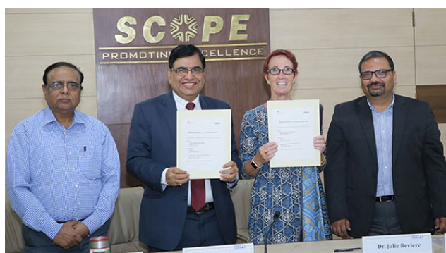
MoU signing between SCOPE and GIZ

Standing Conference of Public Enterprises (SCOPE) is the apex professional organization representing the Central Government Public Enterprises with some State level Enterprises, Banks and other Institutions also as its members. SCOPE's objective is to promote excellence in organizations where public investment is involved, in order to enable them to be globally competitive. It is a proactive interface between its member enterprises and the world outside which comprises the Government, policy makers, stakeholders, other business organizations and the media. SCOPE is also an Employers' Organization representing Indian Public Sector Enterprises at National and International forums in order to make them better place to work