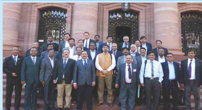
Participants at the Hessian Trade & Invest GmbH, Germany.

Several high ranking civil servants based out of India and abroad, high-profile current and former CEOs and Directors from PSEs, Joint Sector Companies and MNCs would augment the efforts of the core faculty team by sharing their knowledge and experience.