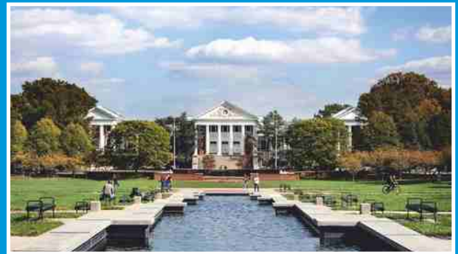
University of Maryland, Washington D.C