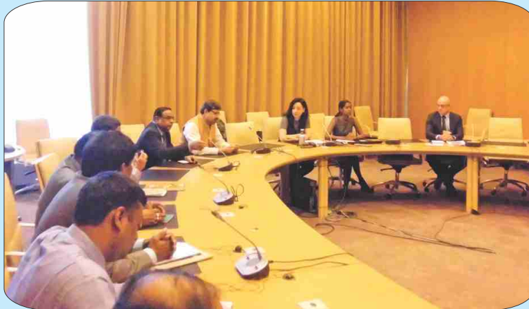
Participants at International Labour Organization, Geneva.

I.L.O is the international Organization responsible for drawing up and overseeing international labour standards. It is the only 'tripartite' United Nations agency that brings together representatives of governments, employers and workers to jointly shape policies and programs promoting Decent Work for all. This unique arrangement gives the ILO an edge in incorporating 'real world' knowledge about employment and work. The main aims of the ILO are to promote rights at work, encourage decent employment opportunities, enhance social protection and strengthen dialogue on work-related issues.