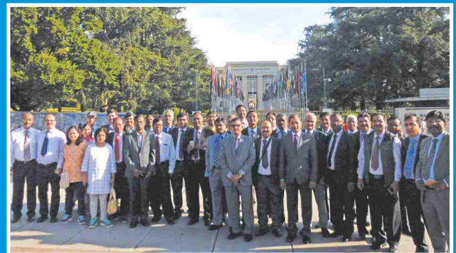
Participants at United Nations Office, Geneva