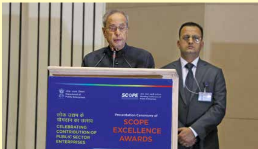
President Shri Pranab Mukherjee delivering the address.

It was a matter of great pride for the Standing Conference of Public Enterprises (SCOPE), Department of Public Enterprises (DPE) and entire fraternity of Public Sector Enterprises as the Hon'ble President of India, Shri Pranab Mukherjee applauded the performance and excellence in Central Public Sector Enterprises. The President complimented DPE and SCOPE for recognizing Central Public Sector Enterprises (CPSEs) for their efforts in inculcating leadership qualities. He said it was a matter of satisfaction that the role of women in CPSEs is being recognized and acknowledged through presentation of a special citation for Outstanding Woman Manager in CPSEs. He stated the same while presenting the SCOPE Excellence Awards on the occasion of the 7 th Public Sector Day held on Monday, 11 th