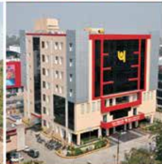
Punjab National Bank Regional Staff College Building at Lucknow