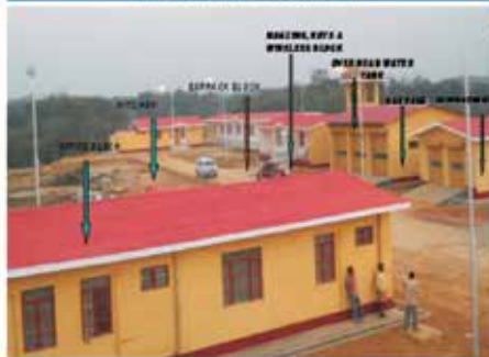
Konaban BOP in Tripura