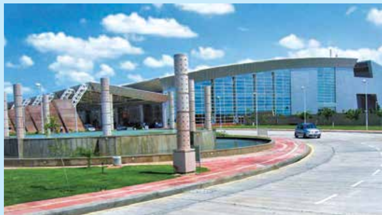
AAI's Jaipur Airport.

Based on the results of the survey carried out by the Airports Council International, (a global non-profit organization of Airport Operators) on Airport Service Quality (ASQ), AAI's Jaipur Airport has been rated as world's No.1 Airport in the category of 2 to 5 million passengers per annum and Lucknow