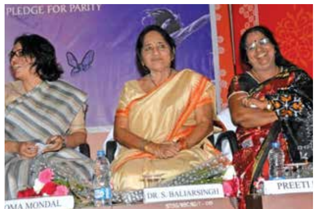
International Women's Day being celebrated at NALCO.