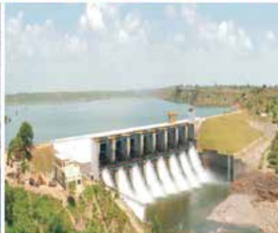
Shaheed Chandra Shekhar Jobat Dam, Jhabua M.P.