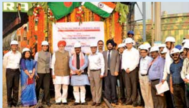
Mr. Dharmendra Pradhan, MoS (I/C) P&NG flagging off goodwill rail rake consignment to Bangladesh.

From Siliguri, the 42 wagons (each with a capacity of 64 KL) rail consignment will travel over 516 kms (253 km in India and 263 km in Bangladesh) on the existing railway line via Rangapani, Singabad, Rohanpur to Parbatipur, where it will be received by