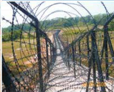
Fencing works at Indo-Bangla Border