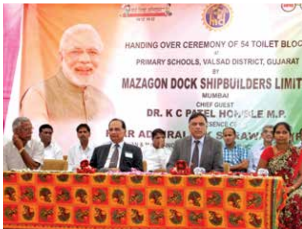
RAdm R. K. Shrawat, CMD, MDL at the handing over ceremony of toilet blocks constructed by the company.

MDL in consultation with the Sarva Shiksha Abhiyaan of Government of Gujarat identified 50 schools in Umbergaon, Pardi and Valsad taluka in South Gujarat for toilet block construction. These toilets were constructed as per design, drawings and specifications given by Sarva Siksha Abhiyan, Govt of Gujarat.