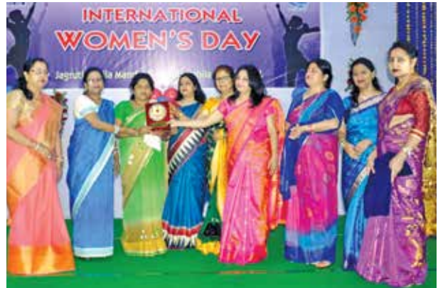
International Women's Day celebrations at MCL.