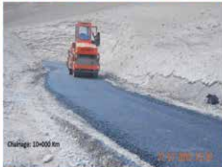
Challenge: 10+000 Km

Working for the development, Progress, and Prosperity of India