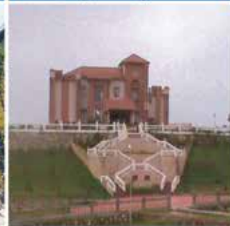
DG House, Assam Rifles, Shillong