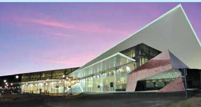
AAI's Lucknow Airport.

All the 11 airports where ACI's ASQ survey is carried out AAI's Airports are rated above the world average i.e. 4.13 on a scale of 5. ■■■